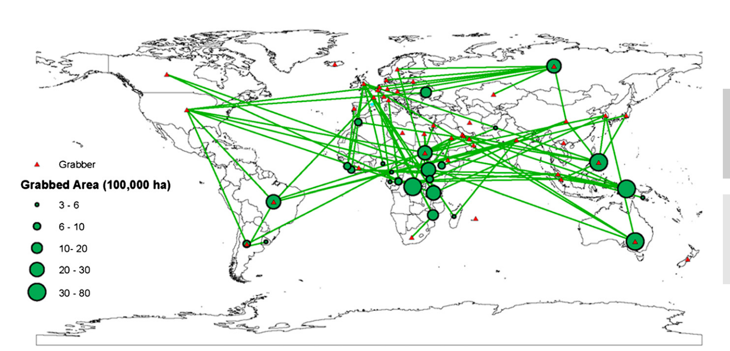
Fig. 1. A global map of the land-grabbing network: land-grabbed countries (green disks) are connected to their grabbers (red triangles) by a network link. Based on data in Table S1 but considering only 24 major grabbed countries (as in Table 1). Relations between grabbing (red triangles) and grabbed (green circles) countries are shown (green lines) only when they are associated with a land grabbing exceeding 100,000 ha.

Moreover, data from as many meteorological stations as possible (in total 185 meteorological stations) were considered to calculate the spatially weighted averages used in each grabbed region.